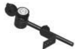
Collar 2" Spacer Push-Button Swingaway

3-1/2", 1" Drop 20091 4-1/2", 1" Drop 20093 4-1/2", 2" Drop 20094