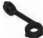
Collar 2" Spacer

3/4" Frame 20915 7/8" Frame 20905 1" Frame 20925