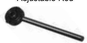
Multi-plane Bar Adjustable Rod