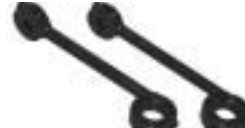
Collar 4" Spacer

3/4" Frame 20920 7/8" Frame 20910 1" Frame 20930