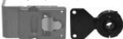
Swingaway Front Spacer Mount

7/16" Collar, 1-1/2" Spacer 91220 7/16" Collar, 3/4" Spacer 91222 Multiplane Collar, 1-1/2" Spacer 91221 Multiplane Collar, 3/4" Spacer 91223