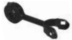
2" Spacer Multiplane