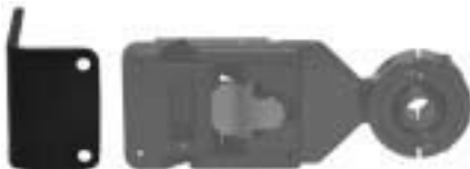
Swingaway Insert Mount