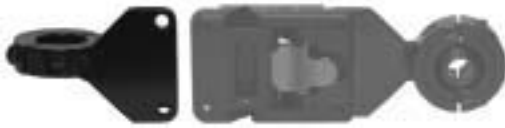
Swingaway Collar Mount, 1-1/2" Deep

3/4" Collar Frame 91227 7/8" Collar Frame 91228 1" Collar Frame 91229