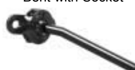
Bar & Ball Bent with Socket