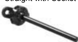
Bar & Ball Straight with Socket