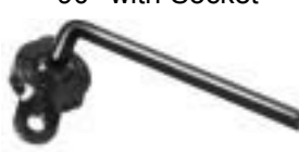
Bar & Ball 90° with Socket