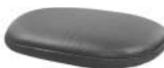
Standard Flat Pad

4" x 5" 21034 5" x 7" 21046 6" x 8" 21057 8" x 10" 21058